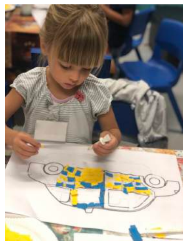
a police car