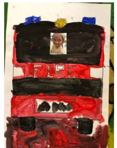
fire engine poster