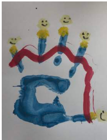
handprint fire fighters