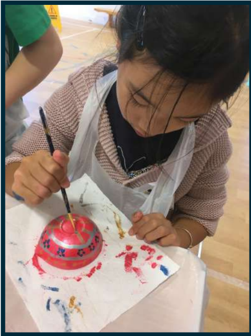
Diya Painting Workshop

Welcome to the first newsletter of the 2022-2023 school year and welcome to all new Camp Canary families! Here are some highlights from this week's camp: