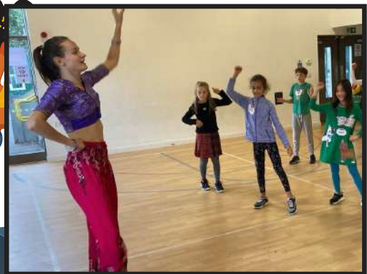
Indian Dance Workshop