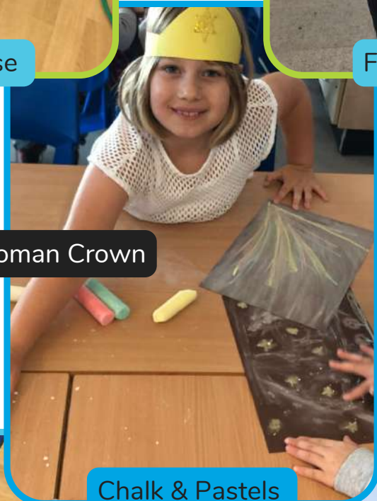
Wonder Woman Crown