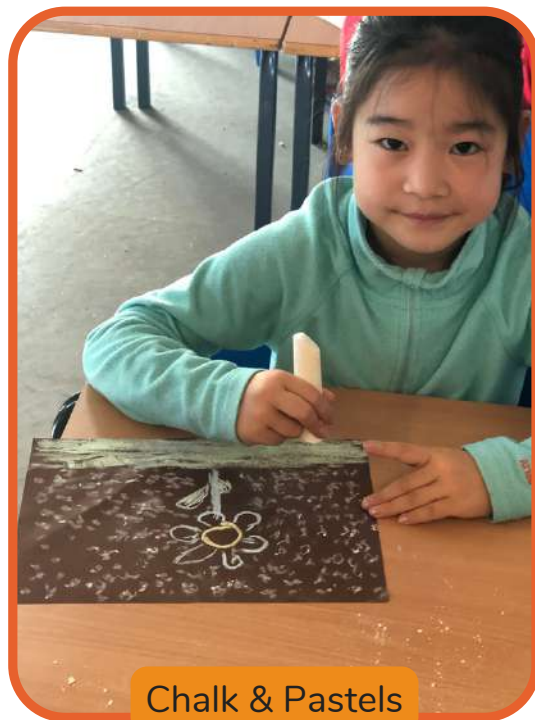
Chalk & Pastels