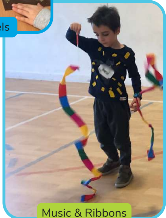
Music & Ribbons