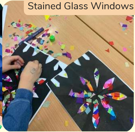
Stained Glass Windows