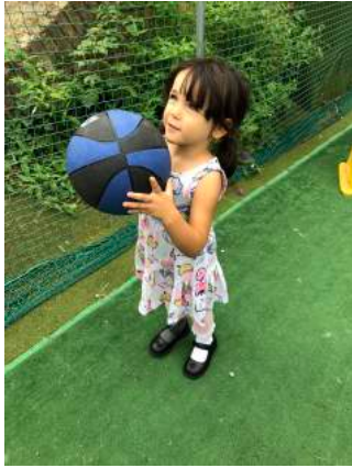
Basketball shoot outs

This week Camp Kidz started the week off with Kickball and aerobics and had a blast at shooting targets during archery and basketball. Juniors enjoyed learning a new sport Pop Lacrosse and have become masters at speed stacking!