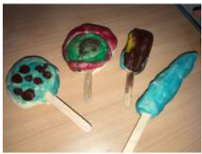
Salt Dough Lolly

Our art this week was delightfully yummy! The children made food collages, a magnificent sculptural feast. We used food to create beautiful artwork such as potato sailboats, pasta mosaics and we even dabbled in some bread painting.